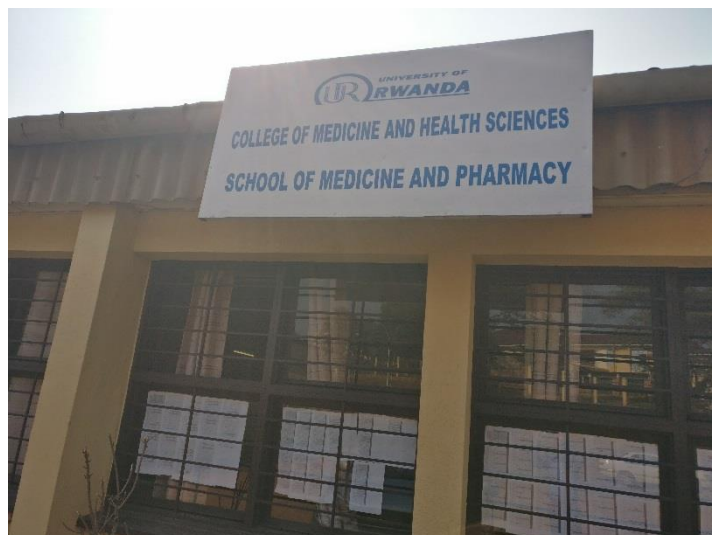
University of Rwanda, College of Medicine and Health Sciences building on the Butare Campus (Southern Province).

The Rwanda Journal Series F: Medicine and Health Sciences (RJMHS) is a medical and health sciences journal published by the University of Rwanda (UR) and its College of Medicine and Health Sciences (CMHS), a higher education institution which was formed through a merger of Rwanda's previously independent public higher education institutions in 2013 ( Wikipedia ). The journal was launched as Rwanda Journal of Health Sciences, published by the former Kigali Health Institute, and was later merged to the Rwanda Journal Series F: Health Sciences, published by the former National University of Rwanda.