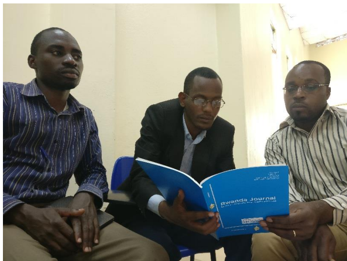
Students & Academic Staff attending one of the author & reviewer publishing workshops.