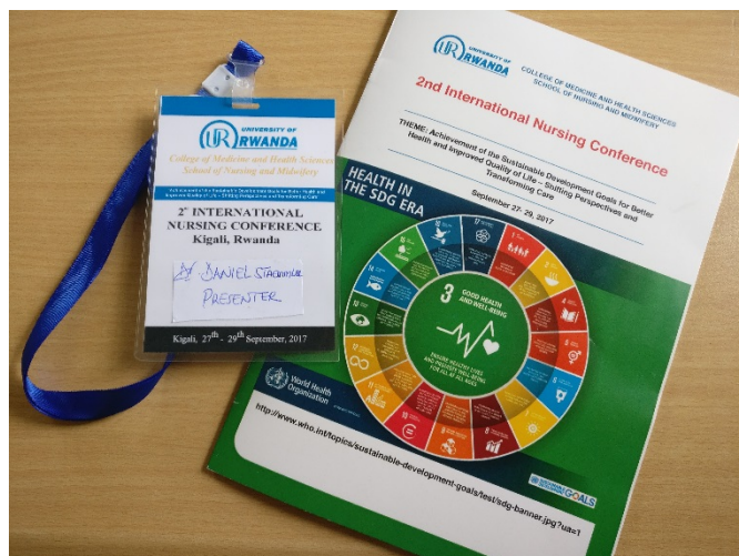
2 nd International Nursing Conference, Sept. 27 – 29, 2017 in Kigali, Rwanda.

A follow-up visit with the Rwanda Journal Series F: Medicine and Health Sciences (RJMHS) was made possible by the Elsevier Foundation in September 2017. The visit was in conjunction with the 2 nd International Nursing Conference (Sept. 27-29, 2017) setup by the University Rwanda (UR) and its College of Medicine and Health Sciences (CMHS). I was invited to give a keynote and workshop on the 2nd day of the conference on the topic of scholarly publication for authors. 150+ students and researchers attended the workshop and can be considered potential authors of for the RJMHS.