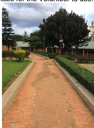
The campus where the Research office is located. I hardly saw more people in this part of the campus, than on this picture.