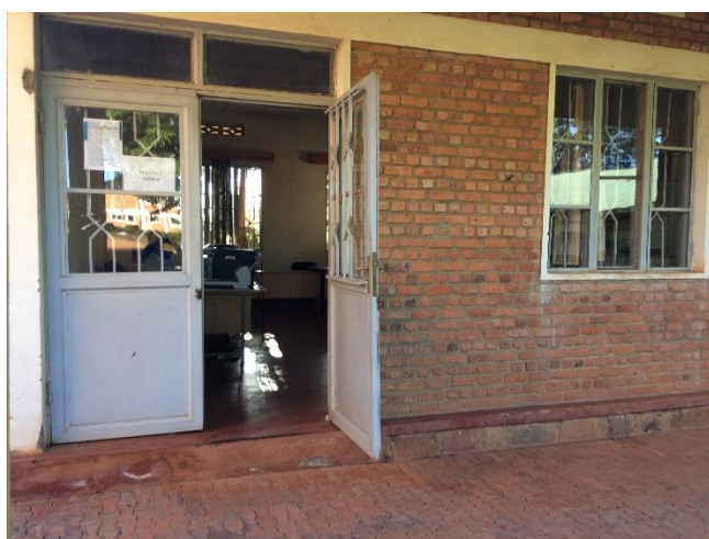
Outside of the Research office – where the journal is located