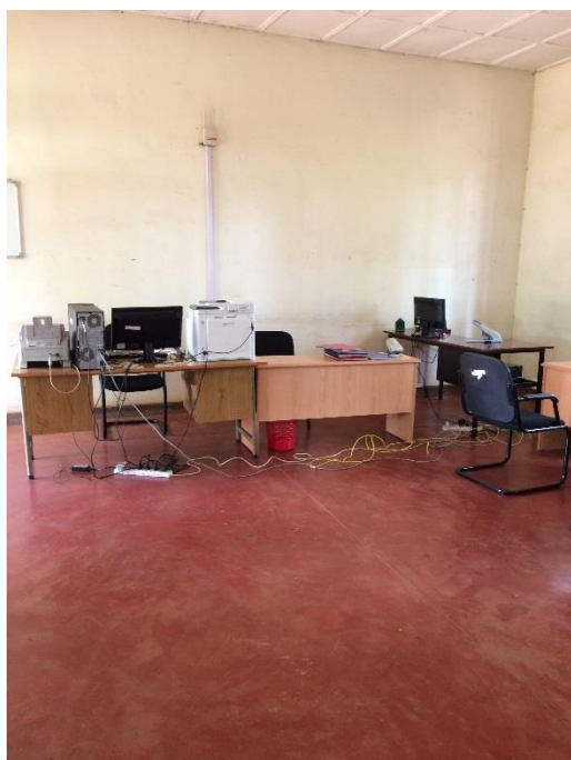
The Journal Office

Make sure to tell the taxi/driver that you need to be at Remera Campus, if you mention College of Health and Medicine, they take you to the old location (very close to Urban)